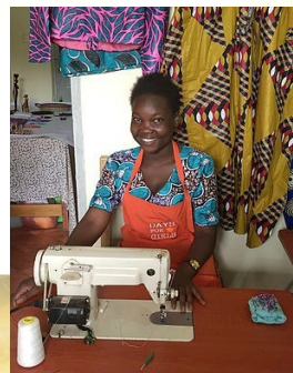
African Woman Business Owner

In July of 2017 69 kits were delivered to the St. Petersburg chapter who boxed and delivered them via container ship bound for Malawi, Africa.